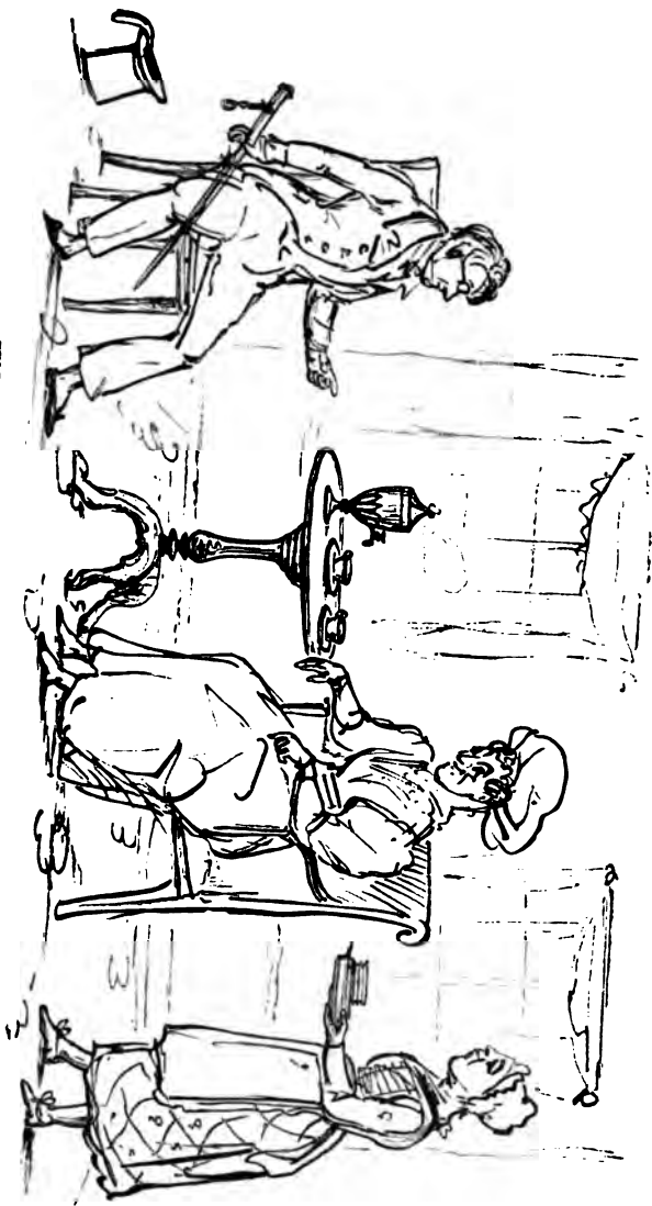
TELEMACHUS ACCOUNTING HIS ADVENTURES TO CALYPSO.